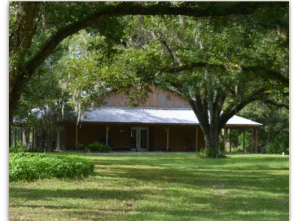
Peace Education Center